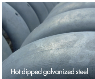
Hot dipped galvanized steel

Our aluminum frames are light and rustproof and are painted with a polyester powder coat (RAL color chart) for a durable finish.